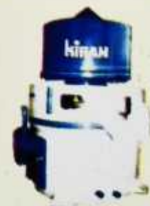
VERTICAL PELLET MILL