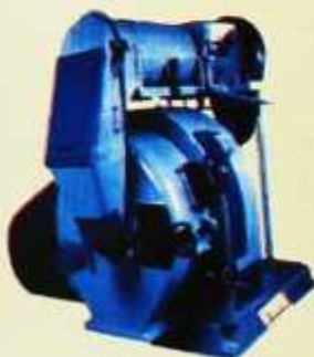
HORIZONTAL PELLET MILL